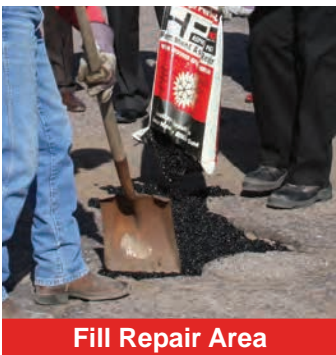
Fill Repair Area

Ride on or Walk Behind Compactor: This method is the most expensive from an equipment perspective but produces the most effective repair. A ride on or walk behind compactor is highly recommended for large road repairs, utility cuts and water main break repairs.