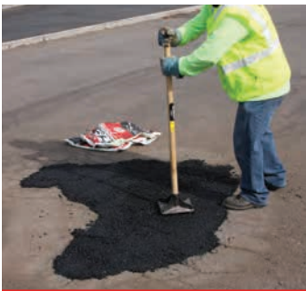
Tamp Repair Area

Road Cuts or Water Main Breaks: Road cuts and water main repairs are generally larger than a pothole and as a result, additional care should be taken in preparation. The sides of the road cut, or excavated area to repair a water main break, should be saw-cut back to a solid asphalt surface. The repair area should be swept to remove residual dust to assure bonding of the HP Asphalt Cold Patch to the existing asphalt or concrete road surface. HP Asphalt Cold Patch should be placed or poured in no more than 2" (5cm) lifts and compacted using recommended procedures for each 2" (5cm) lift. A 1/2" (1cm) crown on the repair is recommended to accommodate future traffic compaction of the repaired area.