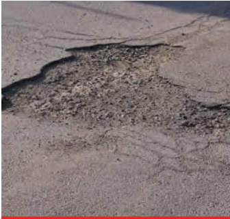
Clean Repair Area

Concrete or Bituminous Surfaces: Clean out the pothole or area to be repaired. Remove all loose debris and clean and square the edges, if possible. Larger potholes, or utility cuts, should be filled in no more than 2" (5cm) lifts, using HP Asphalt Cold Patch, available in bulk from a local stockpile or in convenient 50 lbs. (22.7kg) plastic bags. Compaction of each 2" (5cm) lift of HP is highly recommended. In some soil conditions, it may be necessary to place sufficient material to form a 1/2" (1cm) crown to allow for latent compaction by traffic. (In soft sub-base conditions, settlement may occur and additional HP can be added later to bring the repair to level with the existing pavement surface.)